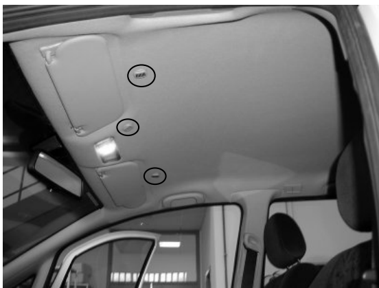
Figure 2: Microphone positions over the front seats.

Synchronized car speed information is also added to the AV@CAR corpus while being acquired using one audio input of the acquisition board.