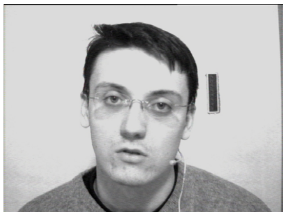
Figure 5: Frame example recorded in laboratory conditions.

The laboratory recordings are divided into two parts. In the first one, the speaker is recorded while repeating some of the tasks done inside the car, with the same camera model (V-1204A), but with controlled lighting conditions and a frontal view of the face, in contrast to the one obtained from the windscreen camera, which is displaced to the upper right corner of the individual. (see figures 4 and 5).