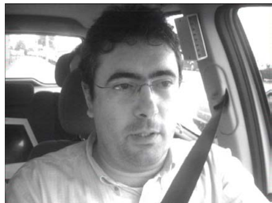
Figure 4: Frame example recorded in driving conditions.

For the video database, a small V-1204A camera (Marshall Electronics, USA) sensitive to the visible and the near infrared bands is placed on the windscreen besides the rear mirror and used to capture the face of the driver. The camera board includes six infra red LEDs which guarantee enough illumination without any other lighting source. This makes it possible to deal with different recording conditions, both during the day and at night.