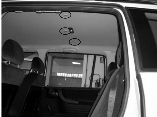
Figure 1: Microphone positions over the rear seats.

Instead of that, the Audio PCM+ board (Bittware, USA) was used, with eight 24-bit input channels and eight 24-bit output channels. This board allows for high speed data transfer from or to the host PC where the corpus is stored. The recordings were made using a DC-Power supplied PC connected to a 12 V battery isolated from the electrical system of the car to avoid electrical noise.