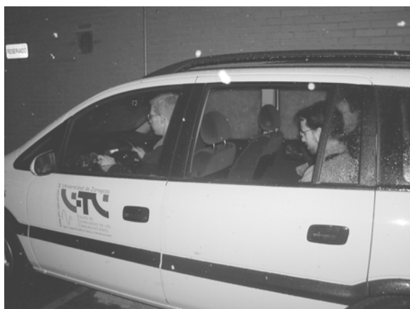
Figure 8: Recording of the corpus in the car.

Data is collected from 20 speakers, 10 men and 10 women whose ages range from 25 to 50.