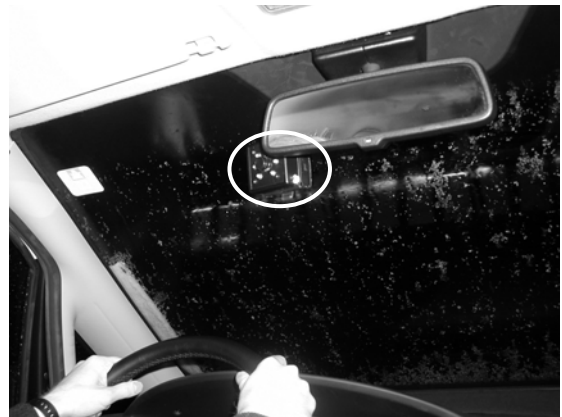
Figure 3: Camera position besides the rear mirror.

The audio part of the database is sampled at 16 KHz and 16 bits for each channel.