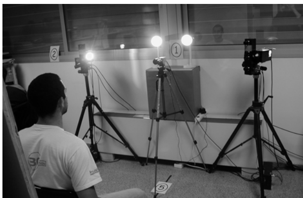
Figure 6: 3D Acquisition Equipment.

In the second part, several pictures are taken to the speaker by means of a three dimensional capture system from Vision RT Ltd (London, UK), composed of two sets of three cameras each. This system takes 6 simultaneous pictures of the individual, 4 to reconstruct 3D geometry and the 2 remaining to capture black and white texture information, generating a 3D textured mesh of the face.